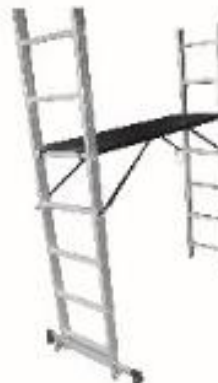
D. Stairway Work Platform