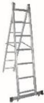
A. Step Ladder