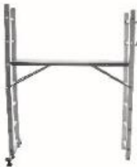
C. Work Platform